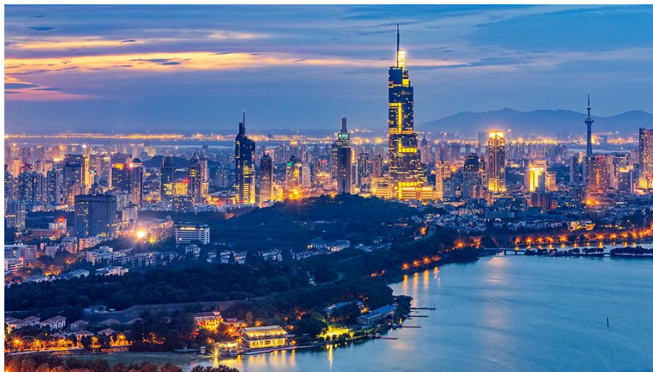
Host city: Nanjing, the capital of Jiangsu Province, China.